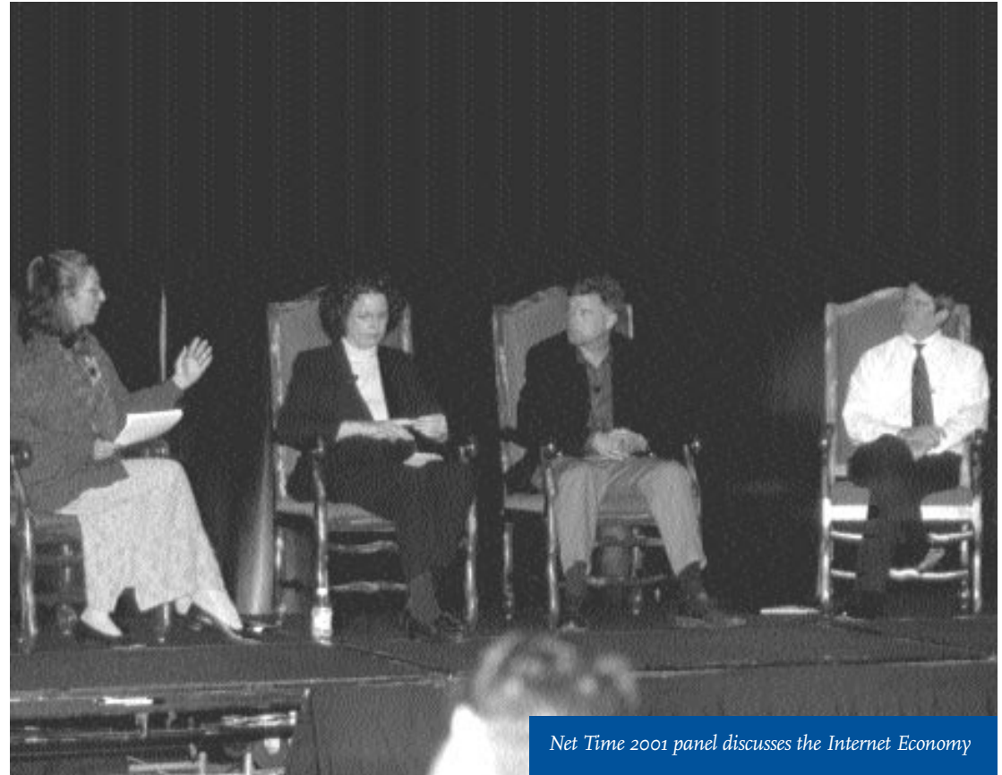
Net Time 2001 panel discusses the Internet Economy