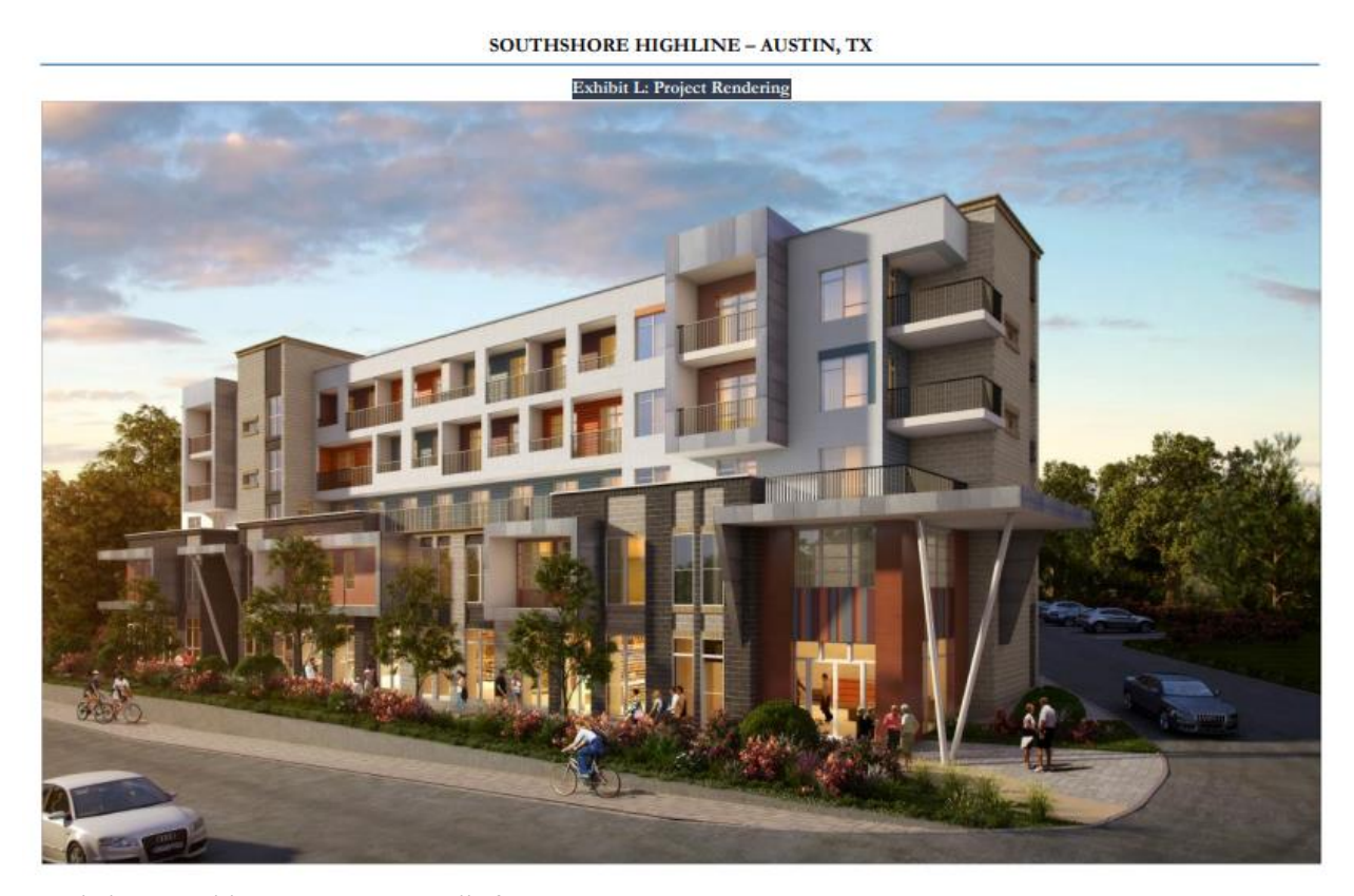
Southshore Highline – MSB RE Fund's first investment